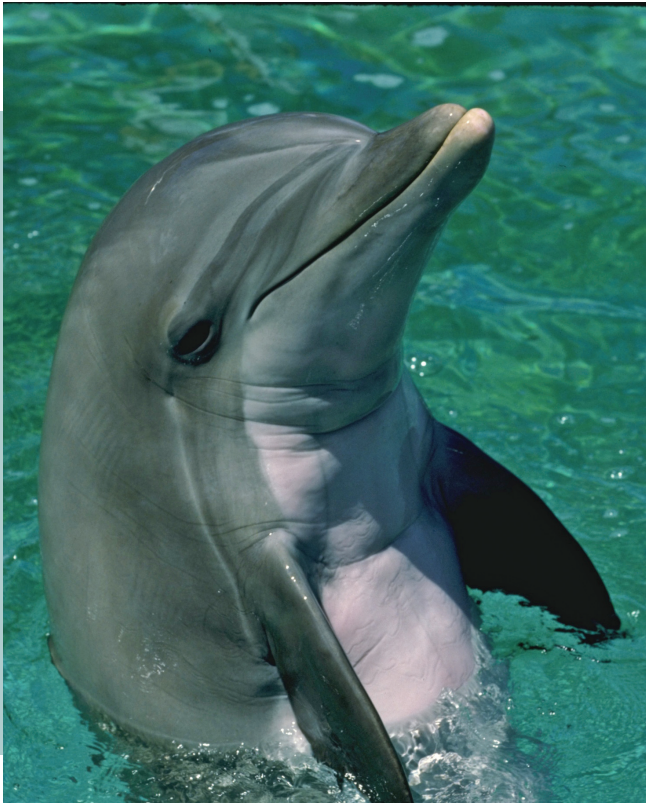
Fact: Dolphins are one of the smartest living creatures on earth.